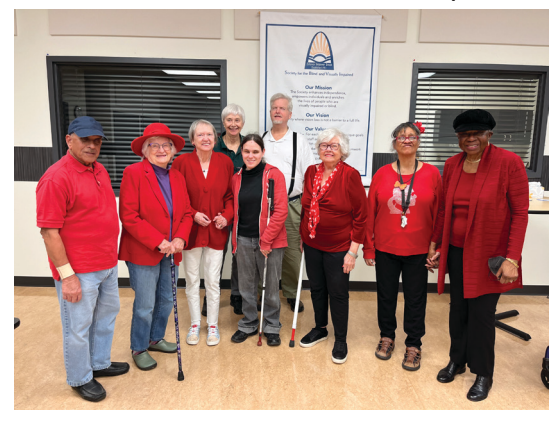
Current Bookworm Book Club, 2023